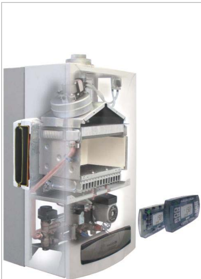
LUNA 3 COMFORT MAX