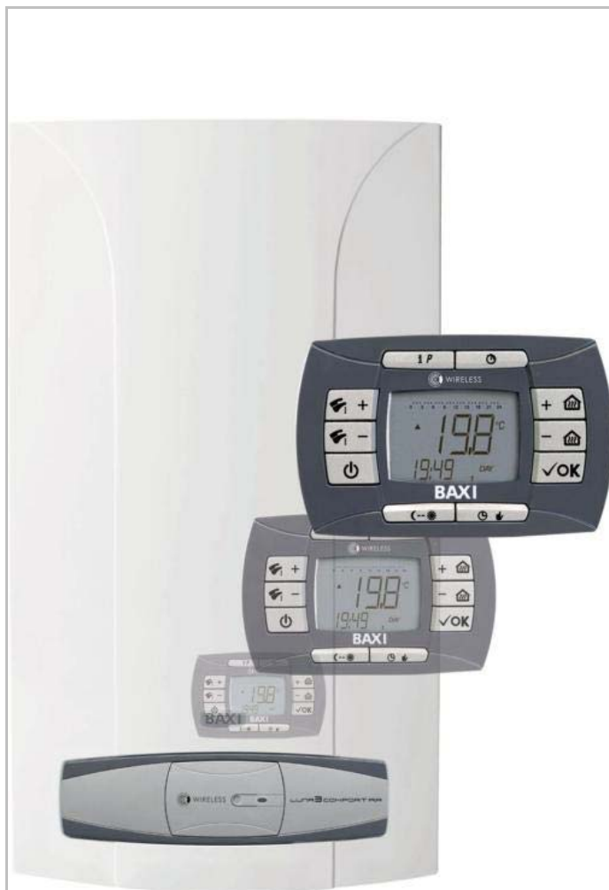
LUNA 3 COMFORT AIR